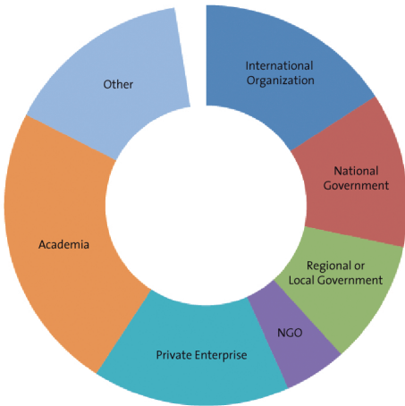
Fig. 1: Areas of employment of our alumni (internal survey)

Given the diverse set of actors working in the field of governance, it is not surprising that many of our alumni now work for private businesses - particularly consultancies such as KPMG and PriceWaterhouseCoopers - and NGOs such as the Global Reporting Initiative, African Parliamentarians' Network Against Corruption or Civil Servants and Allied Workers Union of Zambia.