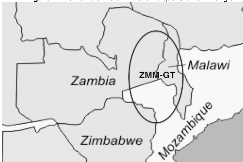
Figure 2 The Zambia-Malawi-Mozambique Growth Triangle

Source: Map taken from http://d-maps.com . Illustrated by author.