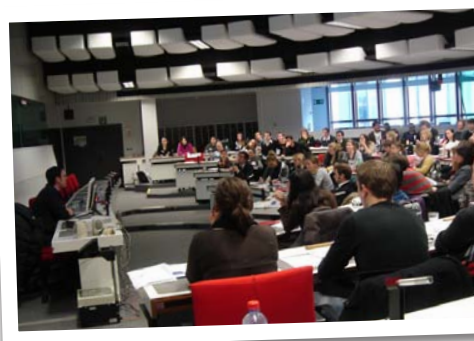
European Commission group visitor centre on rue Belliard

Day Two goes according to plan, students yawning but physically present, some having walked back in the small hours, so I hear. Business Europe. The Egmont Institute. European Commission.... and the usual questions 'Do you offer internships?' 'How did you get your job?' and thankfully not a single, dreaded 'How much do you earn?' Phew, the relief. All in all the students are well-behaved, fine ambassadors for the university (later they tease me for parenting them too much). Then, after much quizzing about whether or not the bus will actually turn up to take us home, we see it pull up on Belliard (I didn't doubt it for a second) and we climb up and in. As we whirr down the motorway, not a cop in sight, the coach is silent, as heads loll and students snooze, dreaming no doubt about the ordinary voting procedure or the implications of the Lisbon Treaty on their future careers.