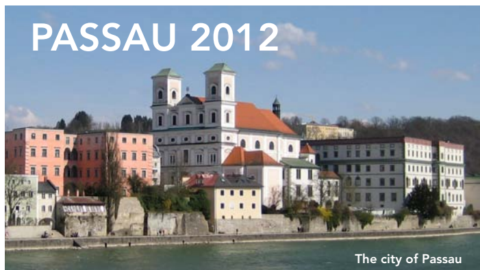
The city of Passau