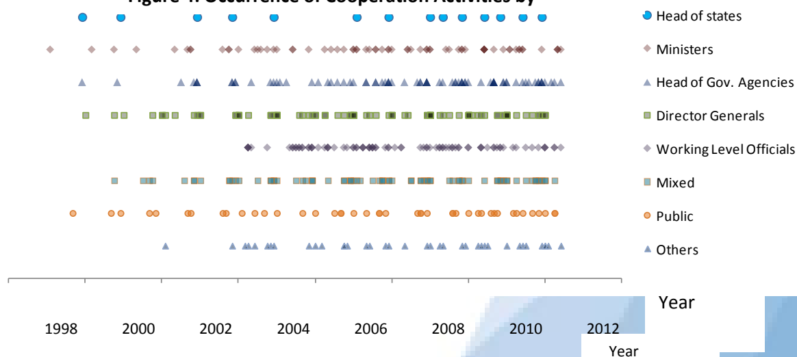
Figure 4: Occurrence of Cooperation Activities by